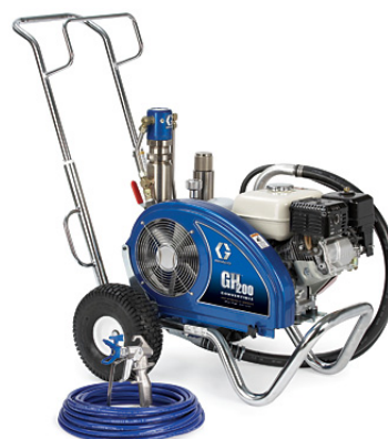
Gas Configuration Shown