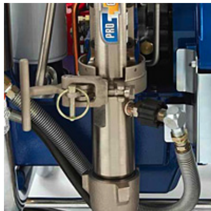
ProConnect no-tools pump removal