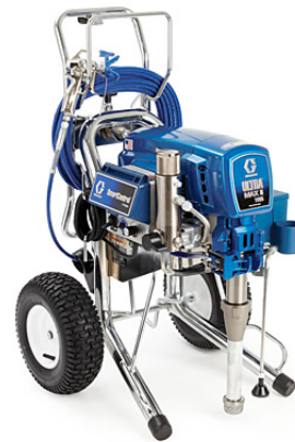
Premium Unit Shown