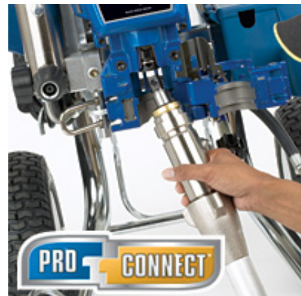
ProConnect no-tools pump removal