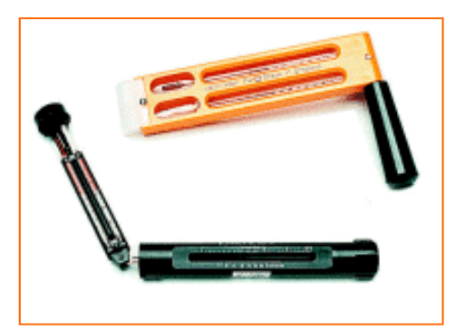
Elcometer 116 Whirling & Sling Hygrometer